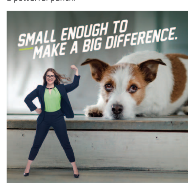
This pocket-sized financial superhero is ready to save the day for Members First Credit Union members.

The credit union's motto, Small enough to make a big difference<sup>TM</sup> truly speaks to this institution's brand and culture. They embody it so well in fact, they've entrusted a mascot to the task of carrying out the message. Affectionately named Mini Powers by employees, this pocket-sized financial superhero is ready to save the day. Whether defending your wallet, fending off fees, or rescuing your loan, this little champion packs a powerful punch.